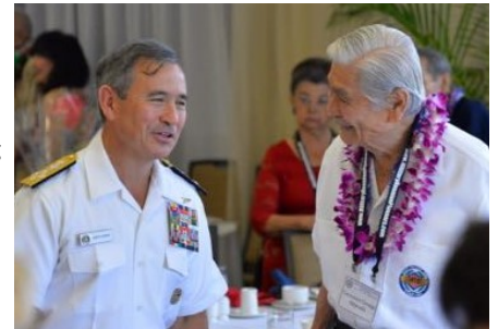
Admiral Harris (L) and former Governor Ariyoshi