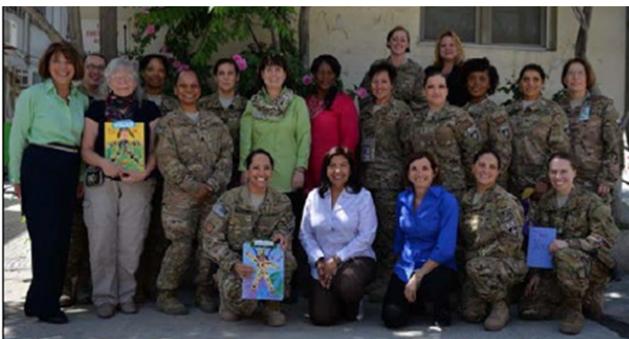
US Representative Martha McSally meets with deployed Moms.

We also take the time to recognize and honor those members of the ANDSF who fought and served as martyrs for the cause of freedom. There have been many of them this fighting season, we recognize that, the Afghan leaders recognize that. While the cost has been high, Afghans still have no issues in finding young men and women who are willing to fill their ranks and honor their memories to also serve to promote a stable and prosperous Afghanistan. The Afghans realize how critical this fighting season is for them, and they continue to improve their capability each and every day.