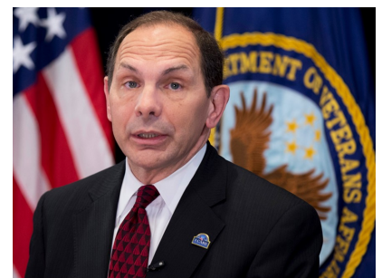
Robert A. McDonald, Secretary of Veterans Affairs

"Our military members and their families make sacrifices that require them to pack up and move with little notice," said Bob McDonald, Secretary of Veterans Affairs. "They shouldn't be penalized after they leave military service by burdensome residency requirements. This waiver will allow students to continue receiving the GI Bill benefits they've earned as states work to comply with this important law."