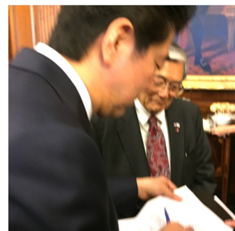
Prime Minister Abe (left) autographing the copy of his speech for former Secretary of Transportation Norman Mineta (right). Abe delivered the speech on April 29, 2015 to a Joint Session of Congress. This picture was taken at Speaker Boehner's reception for PM Abe following his speech.

On May 1st, Prime Minister and Mrs. Abe were escorted through JANM where they showed keen interest in displays of Issei immigration to Hawaii and the mainland, the evacuation and internment, the 100 th , 442 nd and the MIS. This was followed by a reception that evening at JANM, where former Secretary Mineta introduced the Prime Minister. Mineta told JAVA he was impressed to note the Prime Minister's genuine pride and interest in these points, (1) how the Issei population and their families integrated into America's mainstream, their patriotism and contributions to America; (2) the Issei descendants' respect for and interest in the culture and heritage of their ancestral homeland; and (3) the Nikkei role in forging a strong US-Japan relations. Mineta said he sensed the Prime Minister was genuinely touched by the cordial reactions from the Nikkei population.