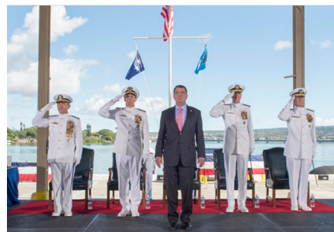
ADM Harry B. Harris Jr., left, Chief of Naval Operations ADM Jonathan W. Greenert, Secretary of Defense Ashton Carter, ADM Samuel J. Locklear III, and ADM Scott H. Swift, render honors during the joint USPACOM and PACFLT change of command ceremony at Joint Base Pearl Harbor-Hickam on May 27, 2015.

Pearl Harbor, Hawaii. In a double change-of-command ceremony in Pearl Harbor on May 27, 2015, ADM Harry Harris was promoted from U.S. Pacific Fleet (PACFLT) Commander to U.S. Pacific Command (PACOM) Commander, and ADM Scott Swift took over as the new PACFLT Commander.