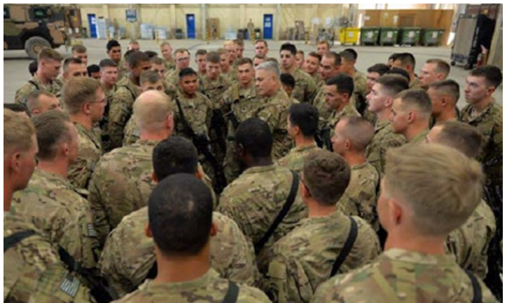
General Campbell (center) visits with 101 st Airborne Division soldiers in Kandahar, where he was formerly Commander.

I certainly want to highlight the relationship I have had, and continue to have with both President Ghani and Chief Executive Abdullah. I meet with each of them several times a week. Sometimes together, sometimes separately. I continue to be extremely impressed with their leadership and how they both want the best for the Afghan people. I'm very pleased with the level of cooperation, integration, and technical skills the ANDSF has demonstrated in Zabul-Ghazni as well as in other areas of Northern Afghanistan. They are using the Army, Police, Air Forces, and other assets and combining efforts to achieve positive results. They have taken the fight to the enemy, made many weapon cache finds, and