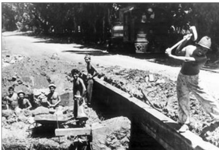
Varsity Victory Volunteers as bridge gang at Schofield Barracks