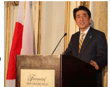
Prime Minister Abe at Fairmont Hotel, San Francisco